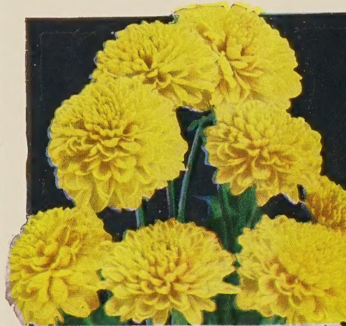
YELLOW BLANKET. 60c each; 3 for $1.50